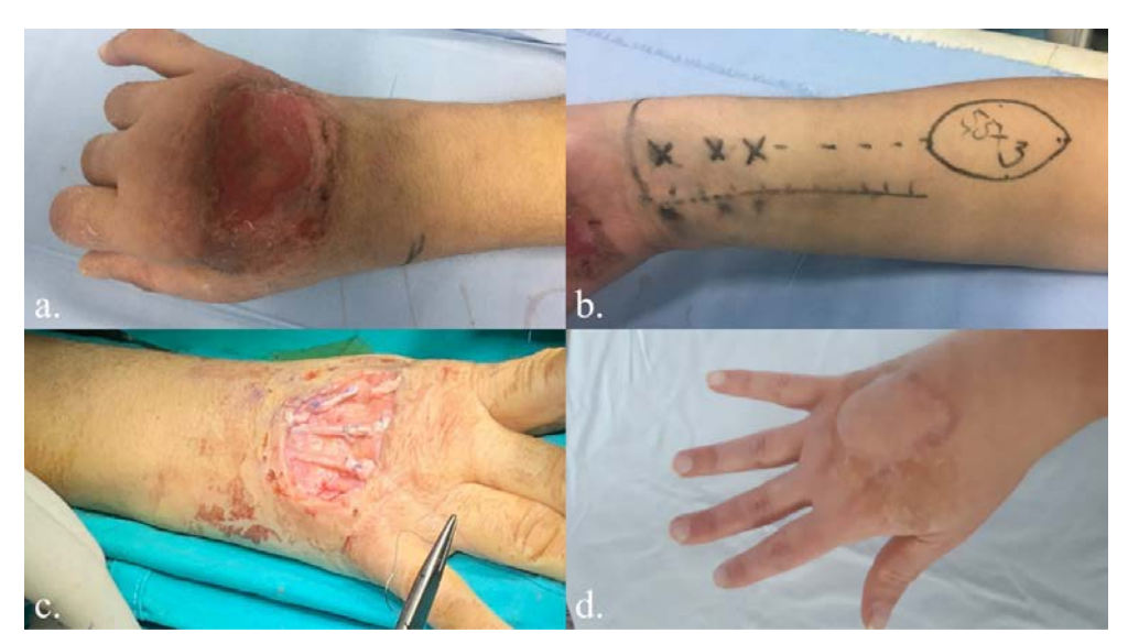
Fig. 4 – a) Soft tissue defect on the dorsal side of the hand after compression injury with a lesion of extensor tendons for the second to fourth finger; b) Planning the elevation of radial artery perforator flap (size 5.5 \times 3.0 cm) with mapping of arterial perforators with Doppler ultrasound; c) Delayed primary repair of extensor tendons for third and fourth fingers and with interposition graft for indicis proprii tendon; d) Good functional result with full extension of involved fingers (one year post-op).

thickness skin graft. Direct closure of the flap donor site was done. The good functional result with full extension of involved fingers and the satisfactory cosmetic outcome was accomplished four months later (Figure 4).