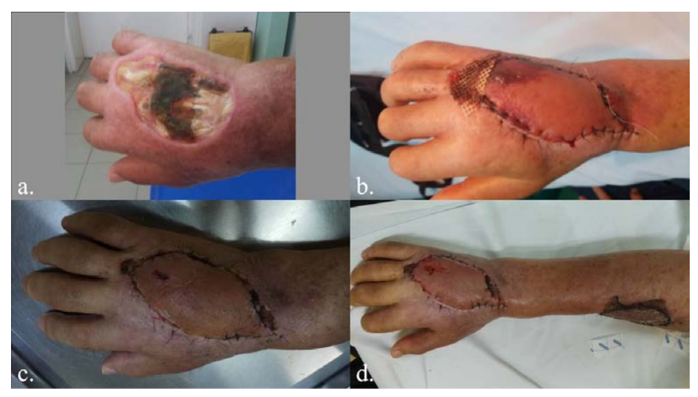
Fig. 3-a) Local chemotherapy drug-induced perivenous extravasation injury which led to necrosis of the dorsal side of the hand; b) Reconstruction of the defect with radial artery perforator flap (size 8.5 \times 5.5 cm); c) Appearance of the flap two weeks post-op; d) Donor side defect covered with a split-thickness skin graft.